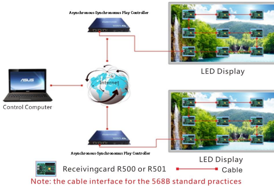
1-1 Asynchronous cluster management mode